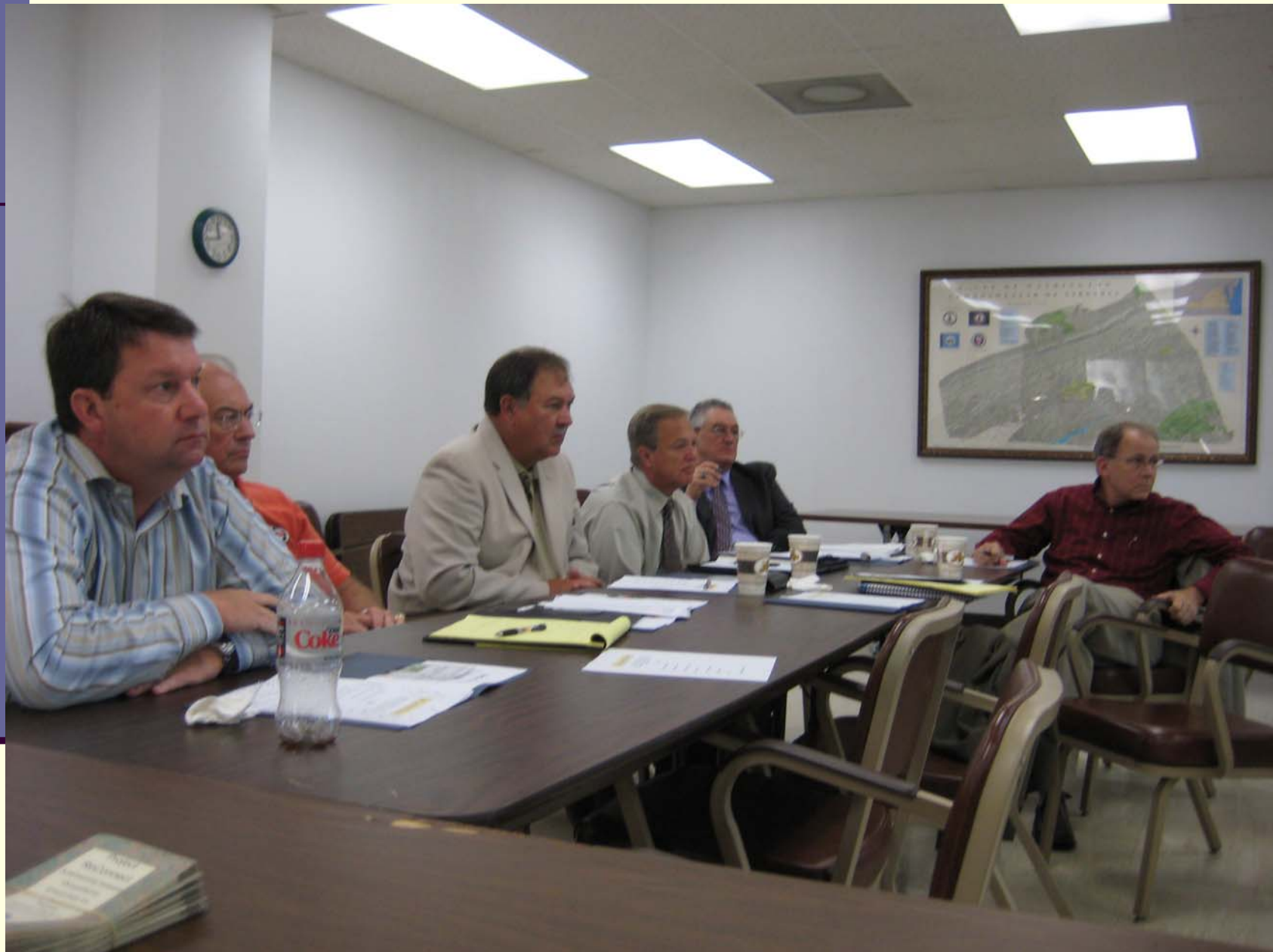
Southwest Virginia Reentry Council