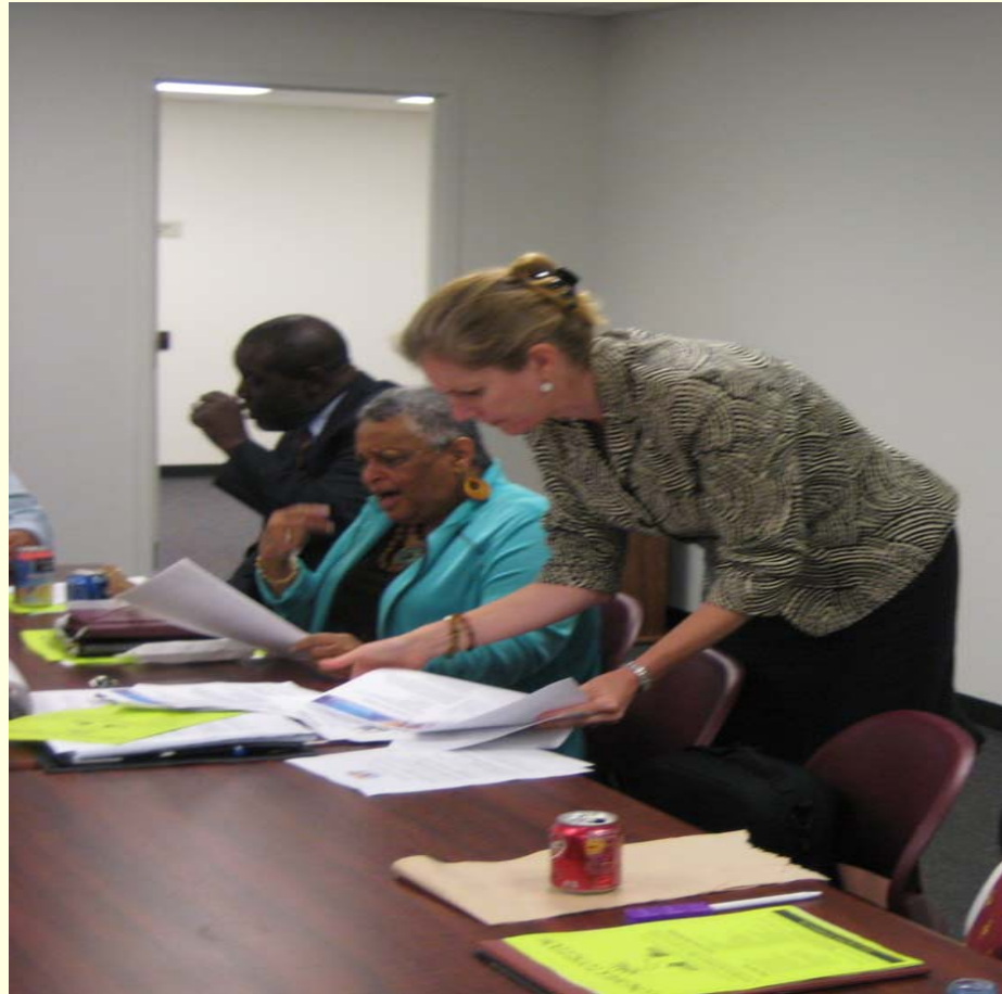
The Workforce Development Subcommittee