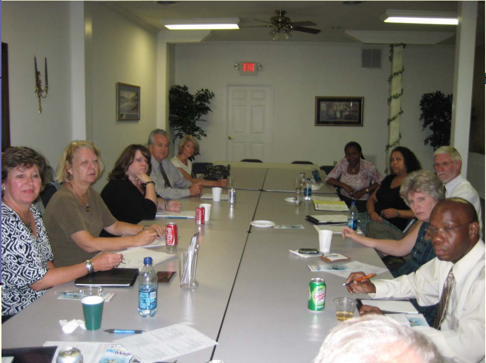
The King George Reentry Council